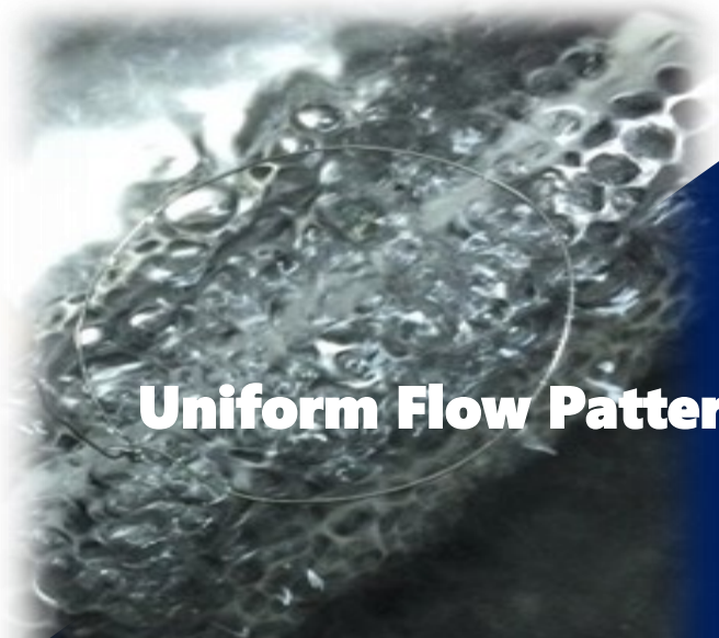
Uniform Flow Pattern

Identifies compromised media rips, tears, and broken metal fibers.